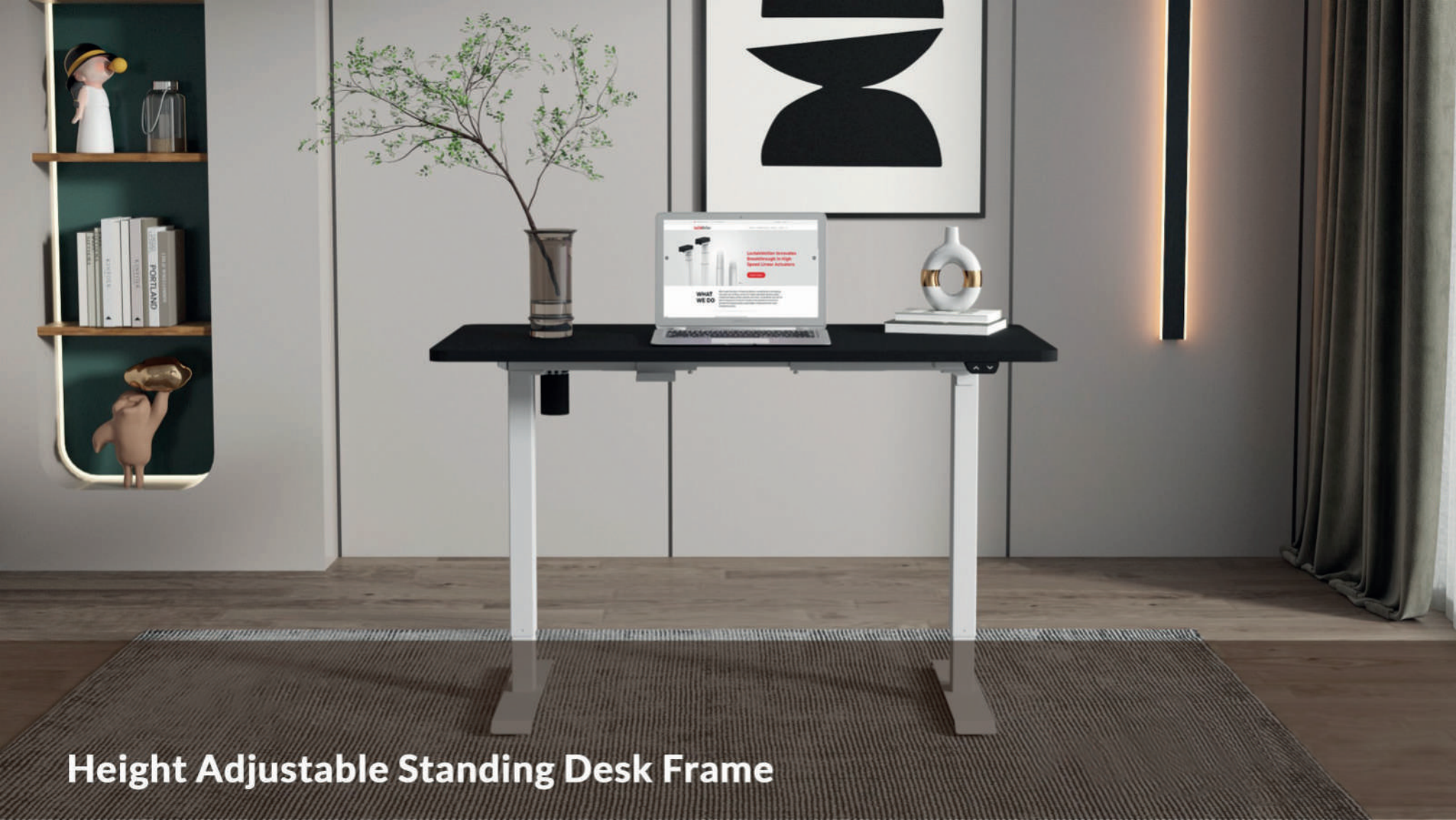
Height Adjustable Standing Desk Frame